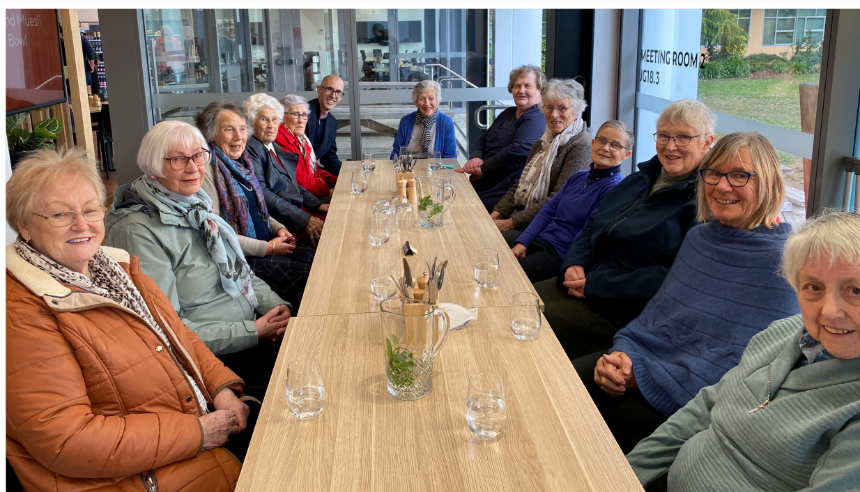
Pictured above from left to right:

Last month the ladies of the AAW, accompanied by the Vicar, went to have lunch at the SIT Café housed in the Narthex of the former Saint John's Anglican Church. This building was deconsecrated and sold to the Southland Institute of Technology over two years ago and since then has undergone considerable renovation, seismic strengthening and modification. The old hall was demolished and a new three story teaching block was added on the footprint and connected to the extended Narthex of the former church building. Many of the original church features have been restored and maintained, and one can still see the font, the stained glass, all the pews, and the plaques embedded in the stonework. The new structural steelwork has been incorporated sensitively into the building to give it the strength needed to survive a seismic event.